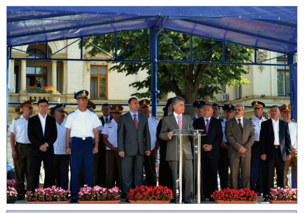
The Minister of National Defence, Mircea Duşa, addressing the troops

Mircea Duşa thanked the populace of Iasi for their participation and respect shown for the military institution. "I can see in the eyes and faces of the participants in this event,