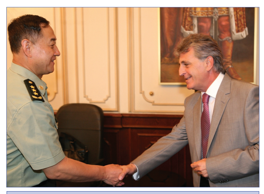
Minister of National Defence, Mircea Duşa, and the deputy chief of General Staff of the Chinese People's Liberation Army, Colonel General Shusen Hou

The Minister of National Defence, Mircea Duşa, and the chief of General Staff, Lieutenant General Ştefan Dănilă, met with Mrs Yuzhen Huo, Extraordinary and Plenipotentiary Ambassador of the People's Republic of China, and with the deputy chief of General Staff of the Chinese People's Liberation Army, Colonel General Shusen Hou, at the Defence Ministry Headquarters, on Wednesday, July 17<sup>th</sup>.