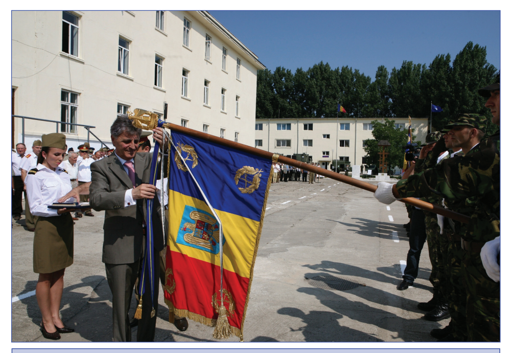
Minister Mircea Duşa decorating the combat colours

The Minister of National Defence, Mircea Duşa, at the Day of Military Communications