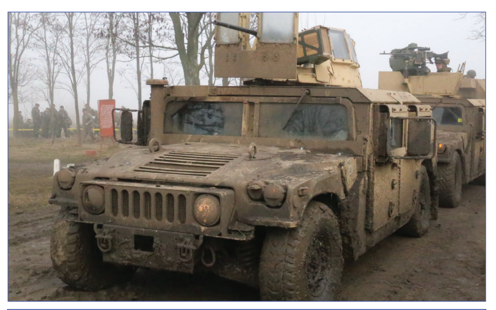
Exercise "Platinum Eagle 17.1"

The Romanian Armed Forces were represented by 100 soldiers of the 2nd Infantry Battalion "Călugăreni", the 1st "Argedava" Mechanized Brigade, 15 JTAC (air controllers for heading positions) and 30 Navy soldiers of the 307th Infantry Marines Battalion.