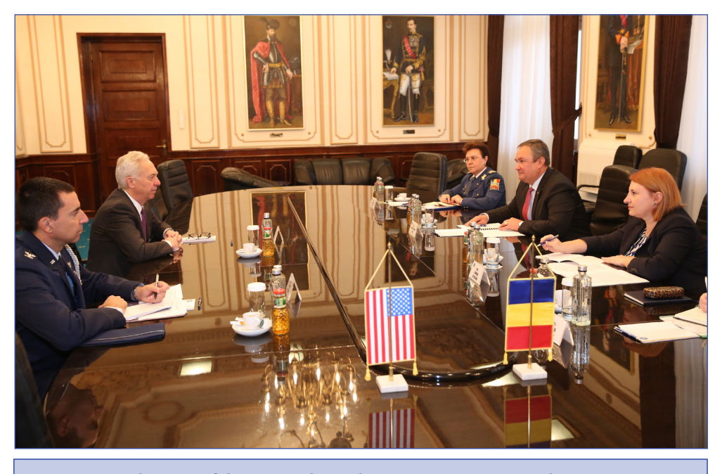
The visit of the US Ambassador to Romania, Hans Klemm

Minister Nicolae Ionel Ciucă reiterated Romania's commitment to the common projects between the two armed forces and to allocating 2% of the GDP for defence expenditures, emphasizing the fact that the Government totally supports maintaining the amount of this percentage.