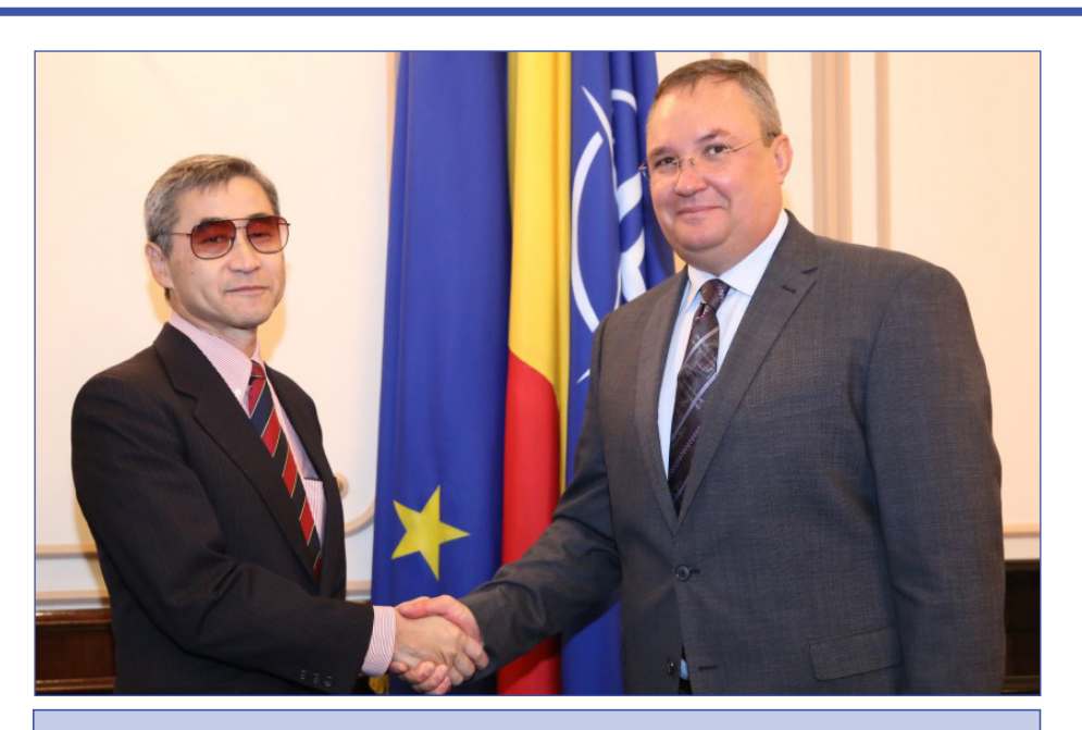
Defence Minister's meeting with Japan's Ambassador to Romania, at the MoND Headquarters

The Minister of National Defence thanked the Japanese Ambassador for the interest showed in the MoND, especially in the context of an ever more complicated security environment.