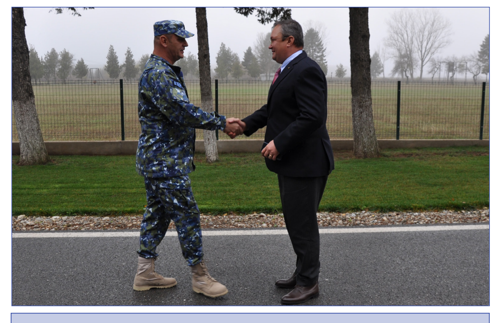
Defence Minister's visit to Deveselu

During the visit made in the base which hosts the Aegis Ashore System, the members of the official delegation emphasized the efforts made by Romania in