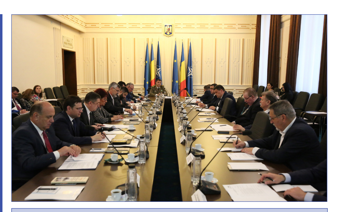
Inter-ministerial Reunion at MoND

On Wednesday, May 29, the Department for Defence Policy, Planning and International Relations organized the Reunion of the Inter-ministerial Committee for the Implementation of the Agreement between Romania and the Unites States of America on the activities of the US forces stationed on Romanian territory and the Agreement between Romania and USA on the emplacement of the US ballistic missile defence system in Romania. Also, the Inter-ministerial Board for the liaison with the foreign armed forces met the same day.