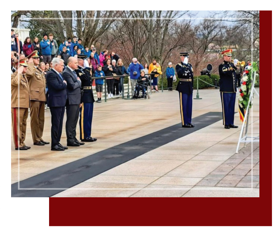
The Romanian Defence Minister laid a wreath at the Tomb of the Unknown Soldier, at Arlington National Cemetery, Washington DC

The wreath-laying ceremony was a tribute to the American soldiers who fought for freedom and democracy in difficult moments of history, but also in the current missions and operations conducted under the command of the North Atlantic Alliance.