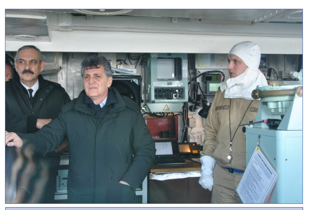
The minister of national defence watched the exercises at sea conducted by Standing NATO Maritime Group 2

The Standing NATO Maritime Group-2 (SNMG-2),