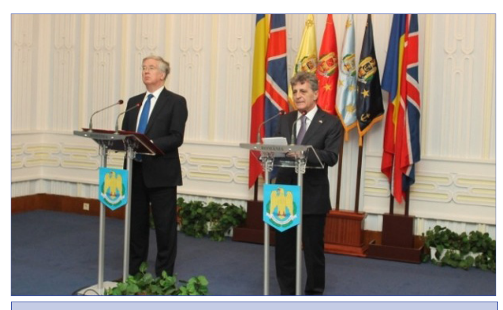
Joint press statement of the two officials

in Ukraine and from the annexation of Crimea by Russia. We have also analysed the status of the cooperation of the two ministries within NATO; we have discussed the way reassurance missions are carried out on the eastern flank of NATO and of the European Union.'