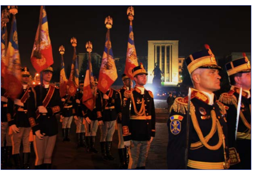
Ceremony of the retreat with torches

The Romanian Armed Forces' Day, celebrated on October 25, is a landmark in the Romanian people's history and consciousness; beyond its strictly historical significance- the liberation of the last Romanian land furrow- it glorifies the deeds of all national heroes, that contributed to the establishment of the Romanian nation and state, gave their lives to gain the state independence and found the national unitary state, fought in the World War I and II and fell on duty in the theatres of operations.