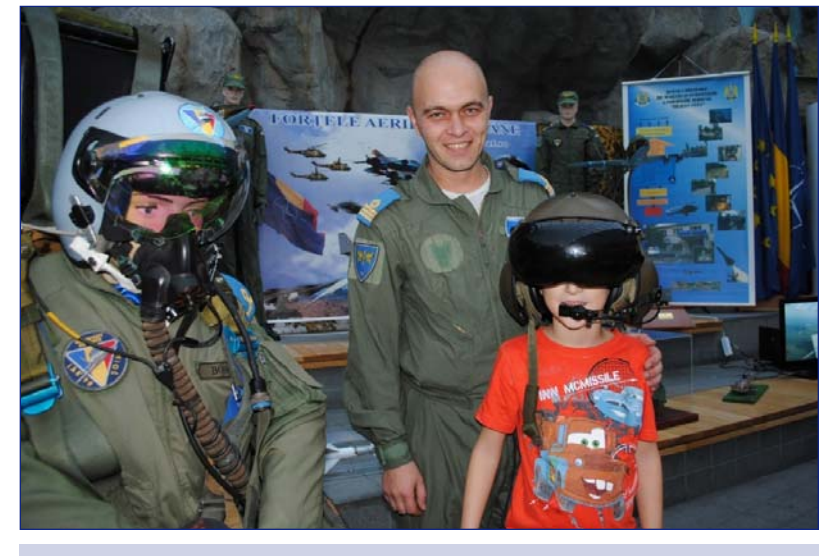
Militaries joining the citizens at AFI Cotroceni

The anniversary symposium "Ministry of National Defence-fundamental institution for the