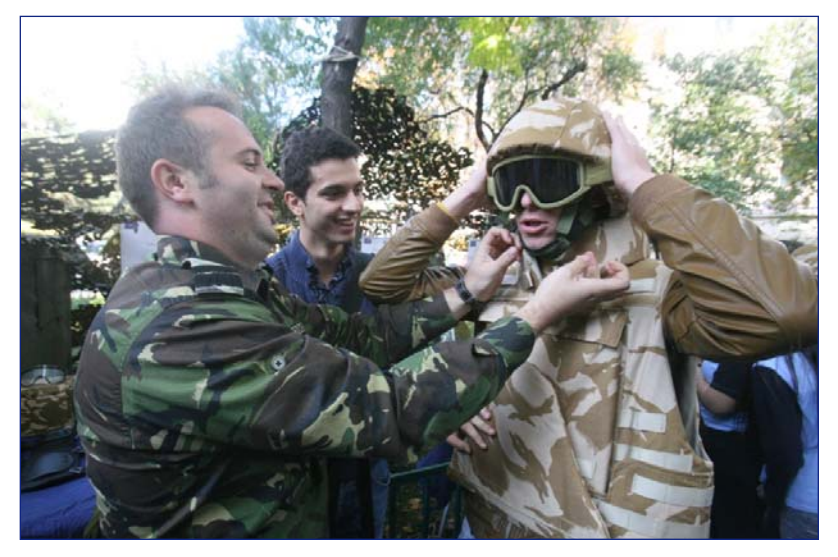
The Day of the Romanian Armed Forces Celebrated in Schools at "Dimitrie Bolintineanu" Highschool of Bucharest

For the first time, the Ministry of National Defence organized the event entitled "The Romanian Armed Forces' Day in schools" throughout 17 to 25 October. This project was organized in several high