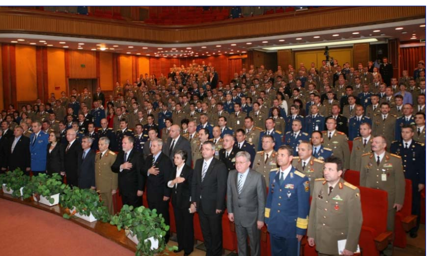
Symposium organized on the Day of the Genral Staff

The General Staff organized a symposium to celebrate 153 years since its establishment, in the assembly room of the defence ministry, on Monday, 12 November.